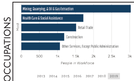
Occupations Most Common, 2019. datausa.io