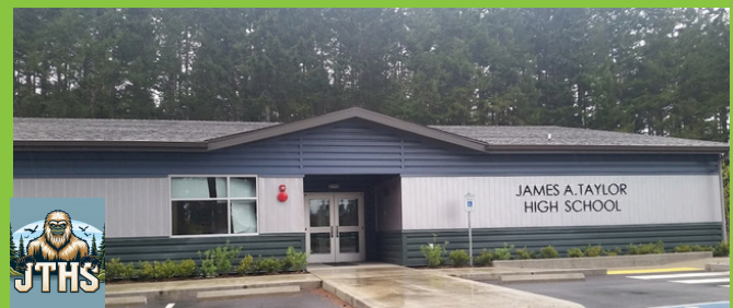
James A. Taylor High School and Homelink