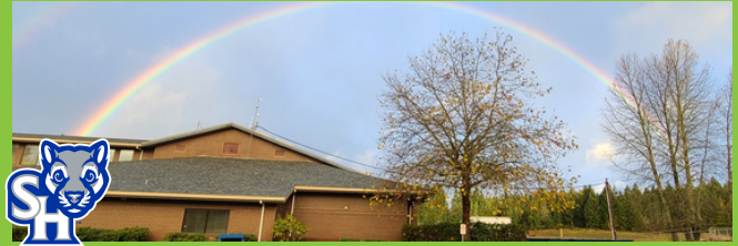
Sand Hill Elementary