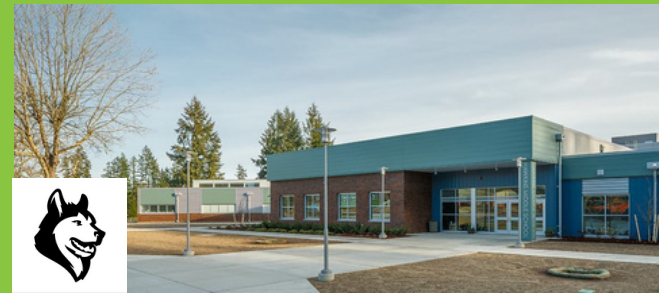
Hawkins Middle School