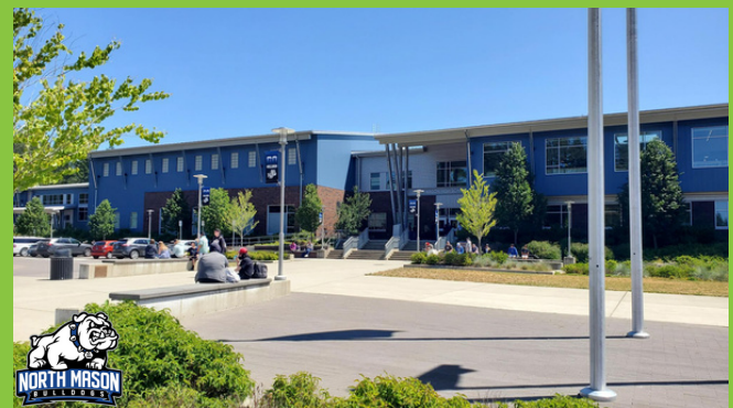
North Mason High School